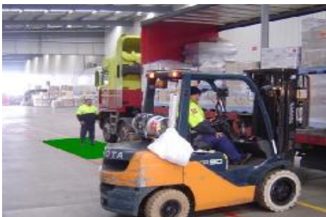
Driver safe zones

Do not approach the forklift driver unless he/she has left the machine, always make eye contact with drivers near you and maintain a 3 meter distance from forklifts and other moving vehicles